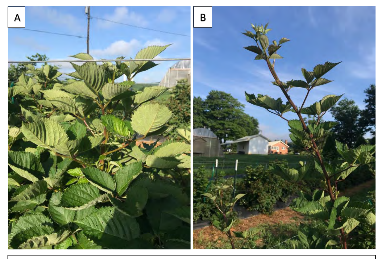
Fig 1. P-Ca treated primocane (A) and an untreated primocane (B). Internodal distance and lateral branch development appear to be influenced by P-Ca.

To our knowledge, P-Ca has not been evaluated on primocane-fruiting blackberry. On primocane-fruiting red raspberry, Palonen and Mohu (2009) demonstrated that P-Ca was effective in reducing cane height, but flower number per cane was reduced. The authors suggested that gibberellins in shoot tips may be associated with flower induction of priomocane-fruiting raspberry, and use of a gibberellin synthesis inhibitor may partly explain the reduction in flower number. The aforementioned trial was conducted on potted plants in the greenhouse environment and was terminated prior to fruit development. Given the limited data available, additional study is warranted.