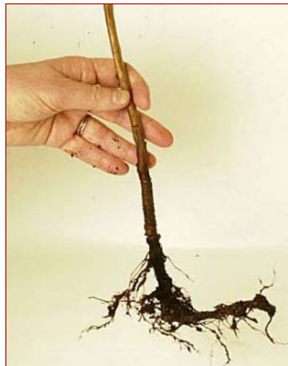
From top left: A bare root cane, process of creating tissue culture plugs, a box of raspberry roots.

Nursery-mature: tissue culture plugs that have been planted in the field and grown out for a season, then dug and sold as bare-root plants.