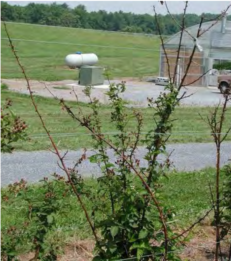
Blackberry winter injury